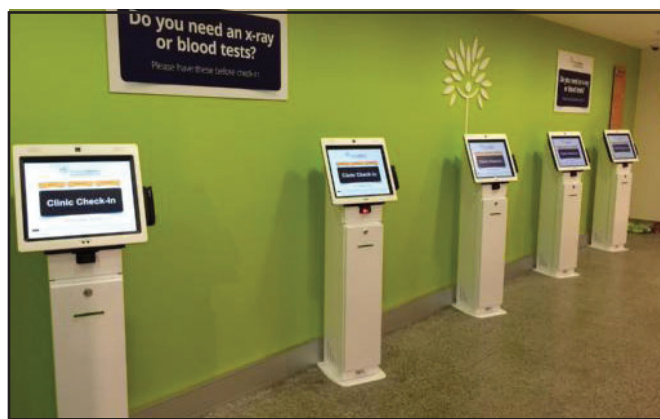
Shown above is a hospital wayfinding system.